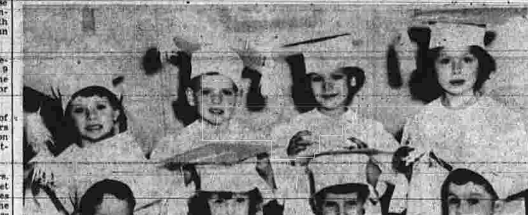
Group photo of graduates of Ballard, Class of '52.